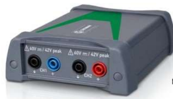
Measurement module MT-USB

The optional MT-USB connects to the mega macs X via the USB socket and turns it in to a practical two-channel multimeter for voltage measurements of up to 60V, as well as current and resistance measurements (subject to licence type).